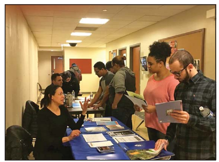
Recruiters/Professors from Northeastern Illinois University (NEIU) and the School of the Art Institute of Chicago (SAIC) were included!