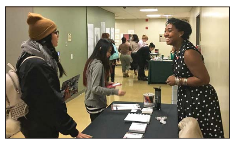
Here's a Recruiter from UIC telling students about studying Art at UIC!

Tuesday, February 8, 2017 was the Art & Architecture Transfer Fair. It was hosted on the 8<sup>th</sup> Floor where all of the Art & Architecture classes are located. Over 100 students attended this awesome event thanks to the encouragement of their professors!!