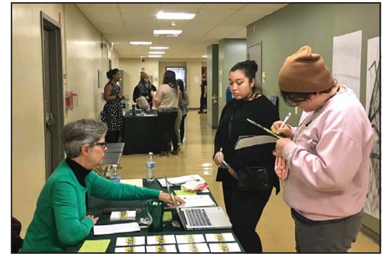
A Rep from Chicago State University giving out information!