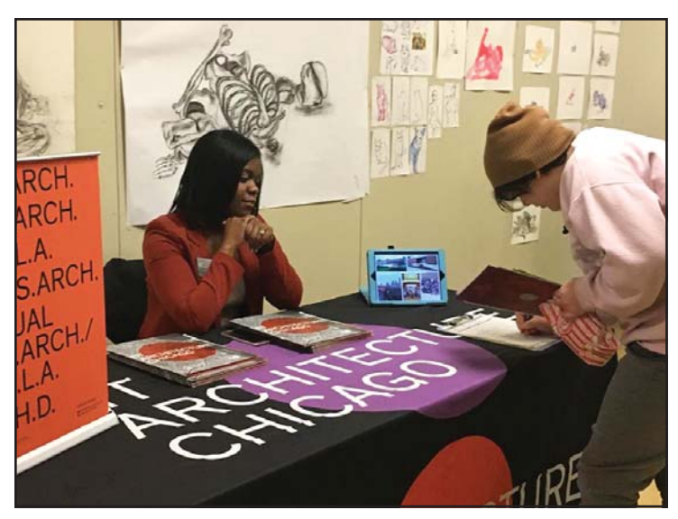
IIT talking about Architecture with a prospective student!