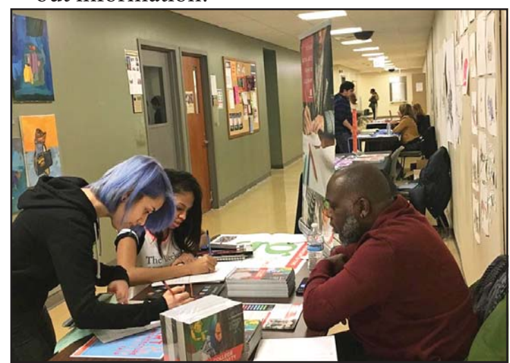
Illinois Institute of Art (AI) chatting with students!