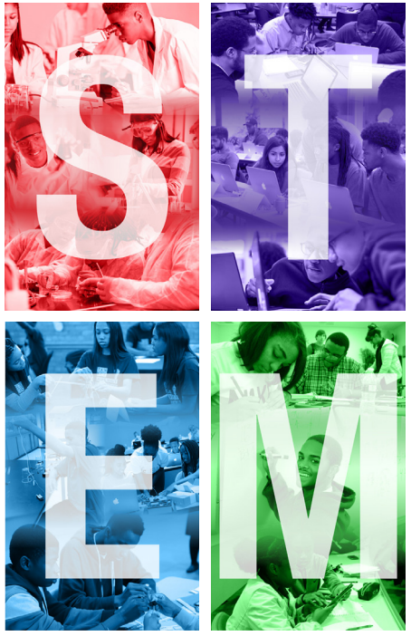
CENTER FOR STUDENTS (PBI Grant)