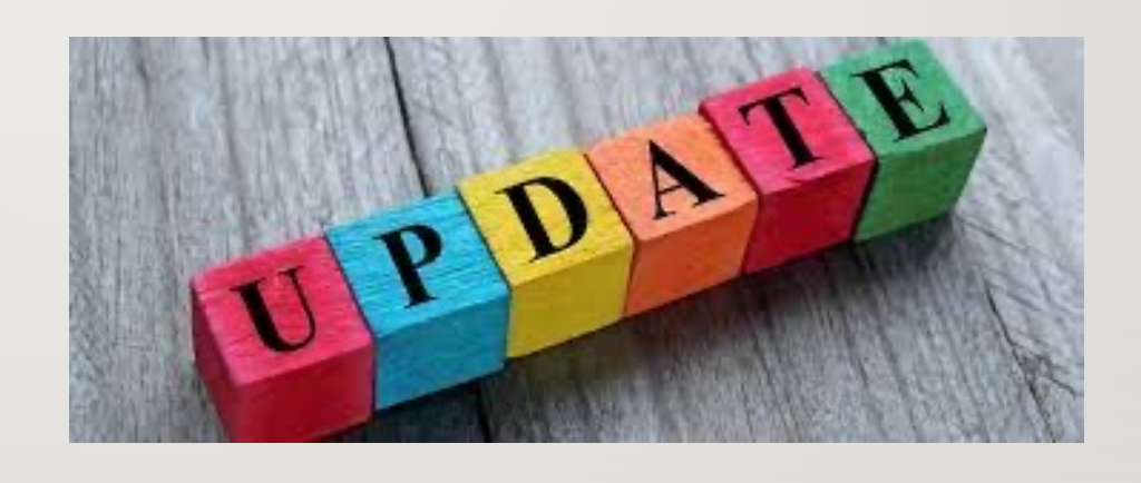
What we did in AY 2021