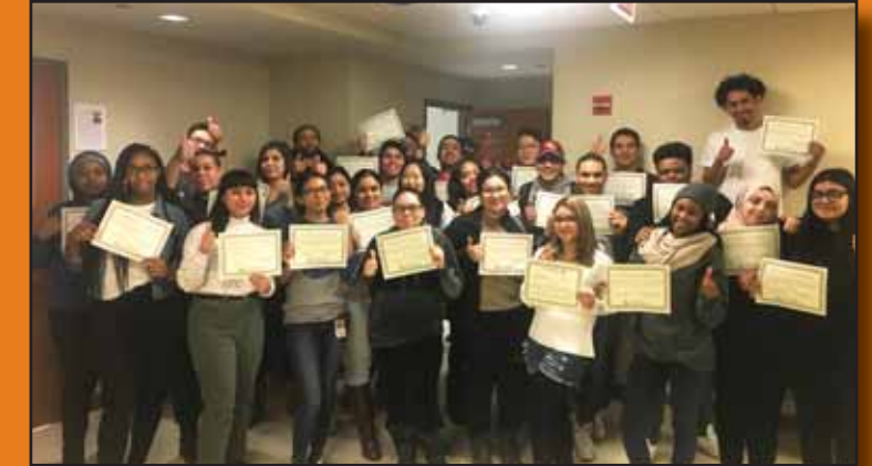
Spring 2019 Transfer Leadership Class Session #1