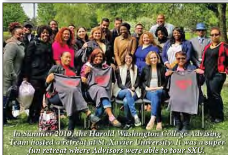
In Summer 2019, the Harold Washington College Advising Team hosted a retreat at St. Xavier University. It was a super fun retreat where Advisors were able to tour SXU.