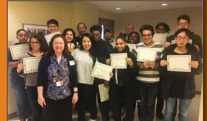
Spring 2019 Transfer Leadership Class Session #2

The Harold Washington College Transfer Leadership Class (TLC) is a five-week optional class designed to help students to transfer to the top schools in the nation and to get up to full funding. On the last day of class, the participants receive a certificate of completion and become Transfer Ambassadors who can tell their peers at HWC about the transfer process!