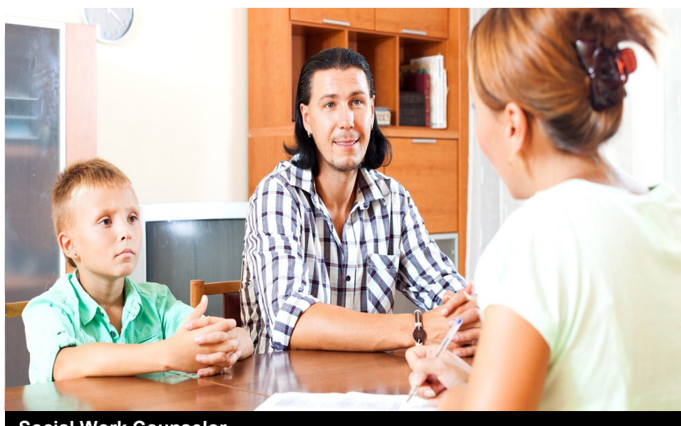
Social Work Counselor